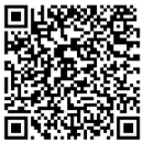
SPRINKLE PREACHING MISSION

Alzheimer's disease is a type of brain disease, just as coronary artery disease is a type of heart disease. It is caused by damage to nerve cells (neurons) in the brain. The brain's neurons are essential to all human activity, including thinking, talking and walking. Most of us know someone who has been diagnosed with Alzheimer's. Many of us have been or are caregivers for those who have the disease. Without going back too far in the history of the church, The Sprinkle Preaching Committee could think of 25 church members who either have Alzheimer's Disease or died from complications of the disease. We want to work towards finding an end to Alzheimer's. The 2024 Sprinkle Preaching Mission has chosen The Alzheimer's Association as the mission focus. Will you help us raise money and awareness? Gather with friends and family and participate in the Walk to End Alzheimer's on August 17, 2024 at 10:00 AM beginning in the church parking lot. You can serve as greeters to others who join us that day, set up the tables and chairs in the Family Life Center, or serve water along the walk route. Together we can make a strong statement to our community about the need for continued research for stopping Alzheimer's. If you have questions, see one of the Sprinkle Preaching Committee Members: Jean Hinshaw, Angie Jordan, Shirley Cottle, Caroline Cress, Lou Wilson, Hannah Howell, or Lori Anne Bowen. And remember the weekly prayer push each week.