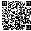
SPRINKLE T-SHIRT PURCHASE

You may scan the corresponding code to make a donation to the Sprinkle Preaching Mission 2024 or to buy a T-shirt. Please note that the QR codes are different and corresponds to giving OR to buying a T-shirt