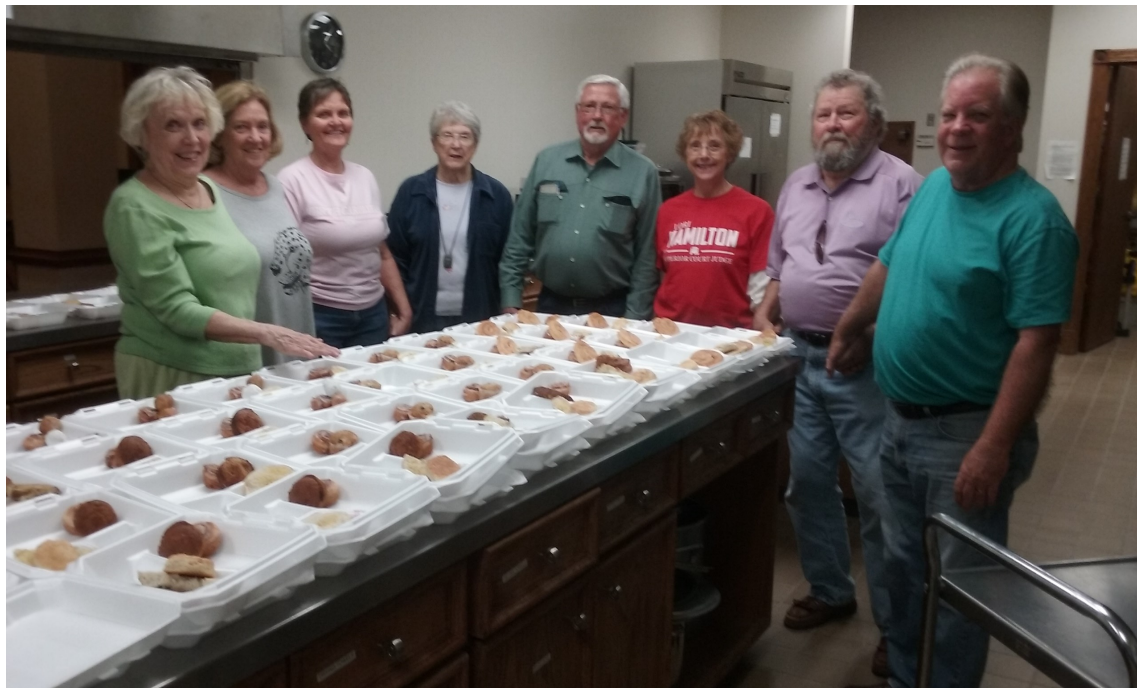
The WHEN Ministry meets on Thursday afternoons at 3:00 pm in the Family Life Center to prepare meals for the needy. ALL are welcome to join us!!